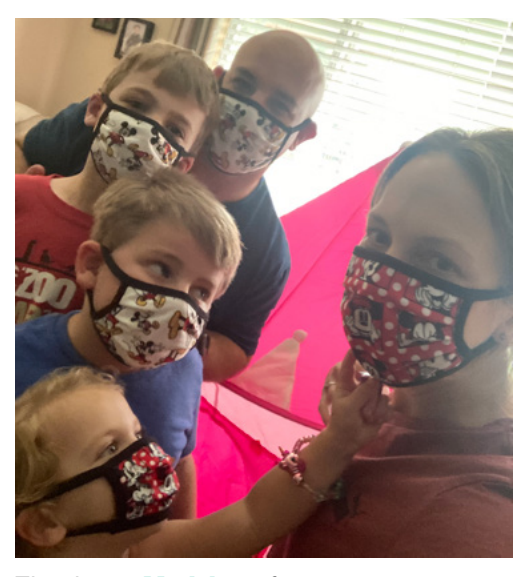
Thank you Medshare for a generous donation of masks for Keaton's Families! #mask4kidscancer